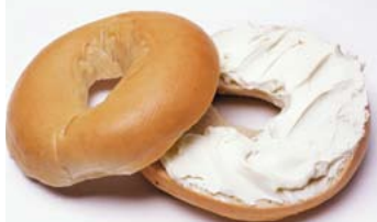
BAGEL + CREAM CHEESE